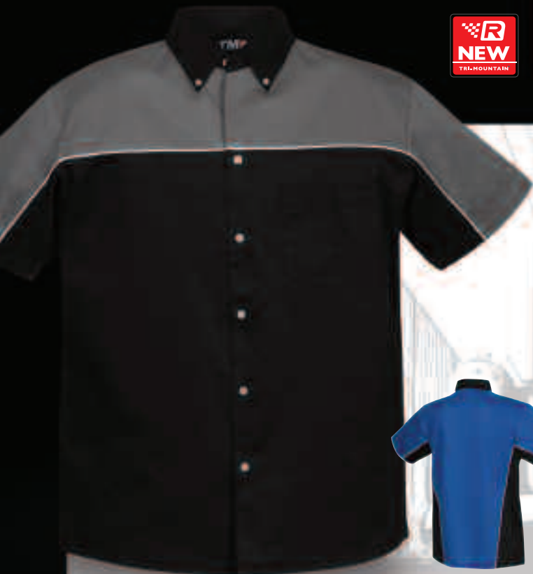
Charcoal Back Body

Ponch, AKA "The Bagman", has created quality air ride suspensions in over 600 cars including some top show winners for over 15 years. The Bagman is one of the most respected names in the industry and has been featured in numerous automotive aftermarket magazines such as Rod & Custom, Street Rodder, Custom Rodder, Street Trucks, Sport Trucks, and Lowrider to name a few. Recently, Ponch won the Street Sweeper Award at the Goodguys Show in Orange County, California.