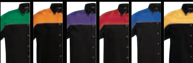
Kelly Green Orange Purple Red Royal Yellow Gold

AIN RACEWEAR ▶ 10 / TRI-MOUNTAIN RACEWEAR ▶ 11 /