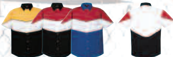
Yellow Gold/ White/Black